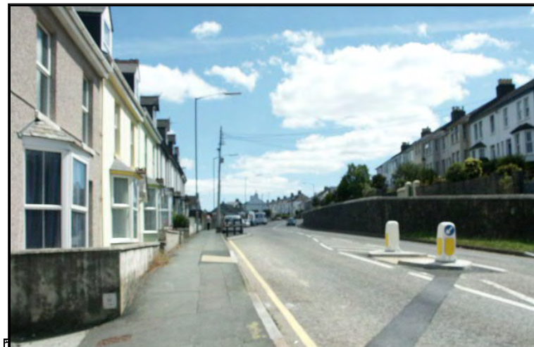
North Road should be landscaped to improve the environment of residents and pedestrians.