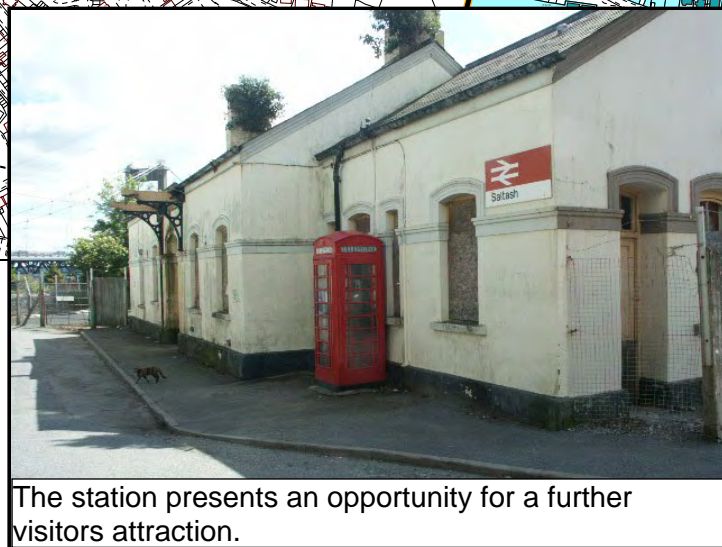
The station presents an opportunity for a further visitors attraction.